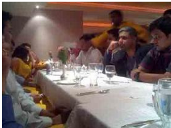
Chairperson with Chennai students

"Towering genius distains a beaten path. It seeks regions hitherto unexplored." -Abraham Lincoln